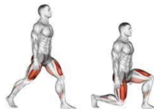
Split Squats or Lunges